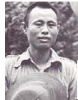
Aung San, Burmese National Hero

Burma ultimately fell back into the hands of the British as the Axis fell, but only with