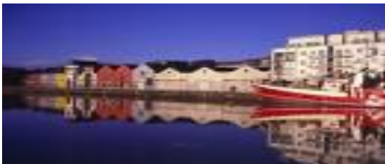
The Galway Waterfront

Ireland, with a population of about 70,000 people. It is a city full of history and full of life. At any point in the day I could wander down Quay (pronounced Key) Street and see people meandering through the shops, or I would wander down the coast of Galway Bay to Salthill and even in the coldest of temperatures see people swimming. After the shops had closed up and day moved into night, I would see fisherman standing in the frigid water of the Corrib River fishing for Salmon and other local fish. There was always something new to see, a street to wander down, people to meet.